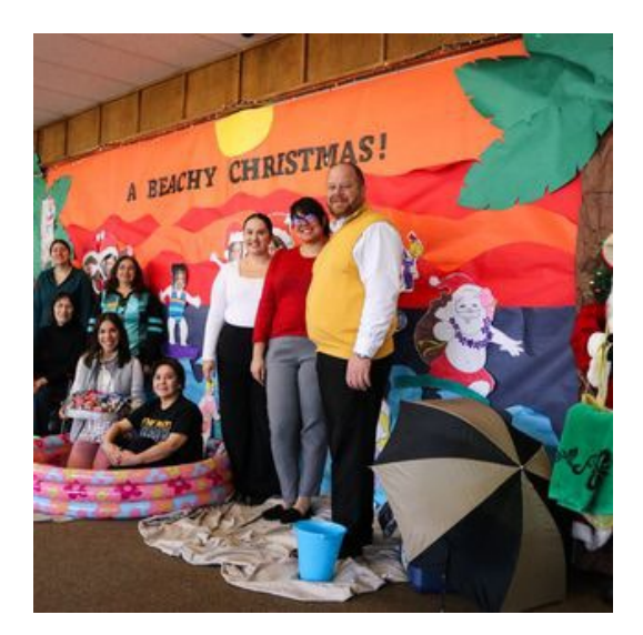
Our Saffell library team won the Christmas decorating contest this year!

This fall, we provided services to approximately 170 GCCC students. We offered our participants a variety of workshops, events, campus visits, and other activities to promote student success through learning, engaging, and connecting at GCCC. Collaborating with faculty, staff, and other student and community groups has increased this semester, and we hope to continue building those relationships in 2024.